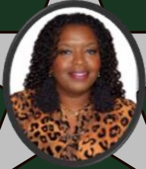
LAMARGO WATTS CACFP ADMIN REVIEW 8:30 AM WEDNESDAY