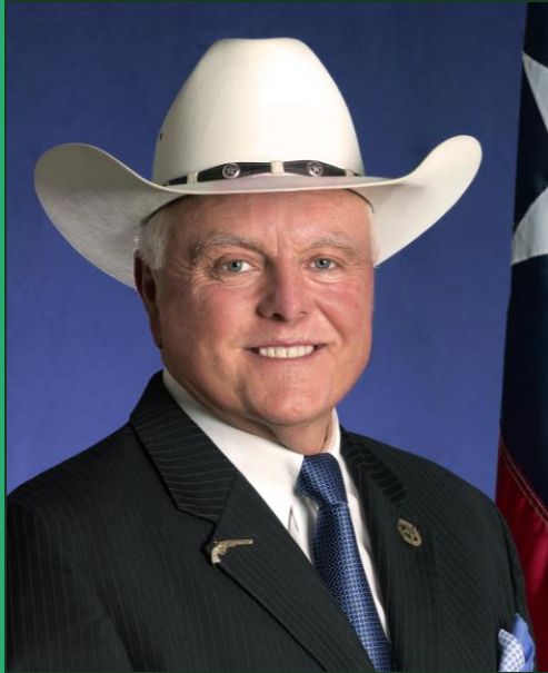
AGRICULTURE COMMISSIONER SID MILLER