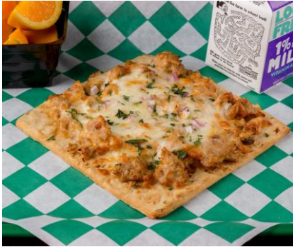
Spicy Sriracha Tuna Flatbread