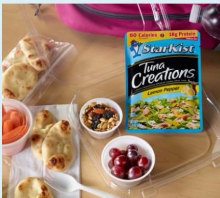
Assemble Quick Meal Kits