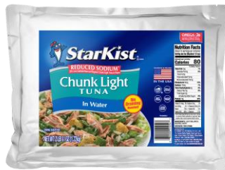
Reduced Sodium Chunk Light Tuna in Water Pouch (6/43oz) SK #514540