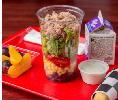
Mexican Tuna Shaker Salad