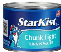
Chunk Light Tuna in Water Can (6/66.5oz) SK #16500