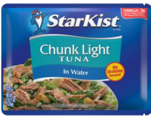
Chunk Light Tuna in Water Pouch (6/43oz) SK #22120