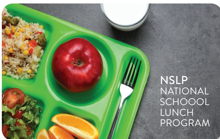
NSLP NATIONAL SCHOOL LUNCH PROGRAM