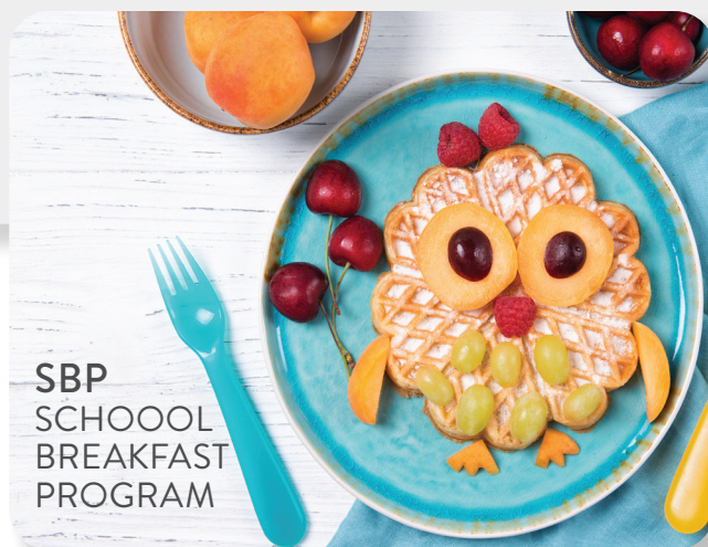
SBP SCHOOL BREAKFAST PROGRAM

The School Breakfast Program (SBP) is a federal assisted meal program operating in public and non-profit private schools and residential child care institutions. The SBP started in 1966 as a pilot project and was made a permanent entitlement program by Congress in 1975 to provide wholesome breakfasts each school day morning to improve the health and nutritional well-being of students.